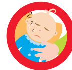
Drowsy, less responsive, vacant or difficult to wake