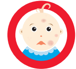
Skin that is pale, blotchy or turning blue