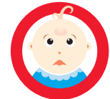
A bulging fontanelle (the soft spot on a baby's head)