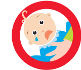
Irritability, especially when picked up (can be due to limb or muscle pain)