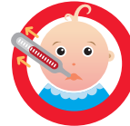
Fever (a temperature of above 37.5°C)