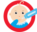
Vomiting and refusing feeds