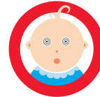
Blank and staring expression