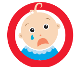
A high-pitched, moaning cry