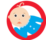
A stiff neck